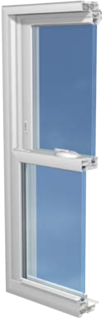
4600 Double Hung