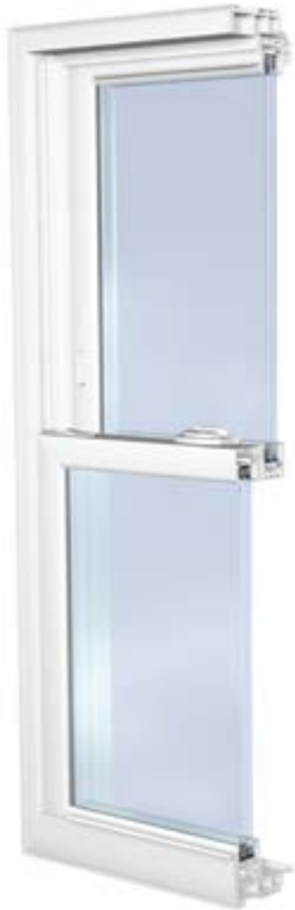
4700 Double Hung