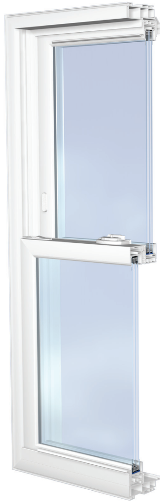
4700 Double Hung